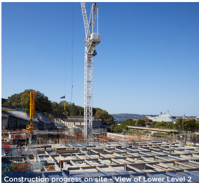
Construction progress on site - View of Lower Level 2

Construction works by Richard Crookes Constructions (RCC) over recent months have