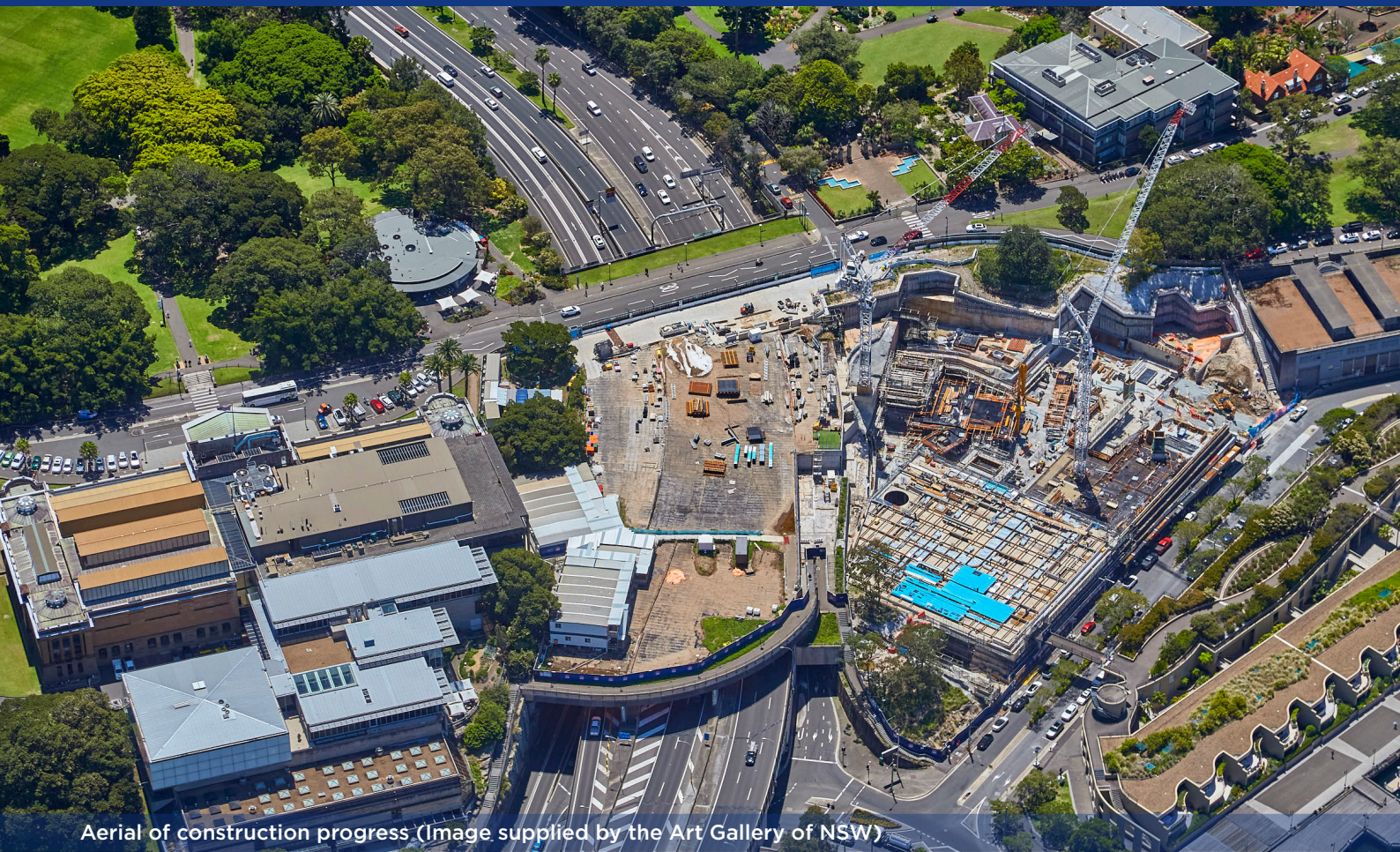
Aerial of construction progress