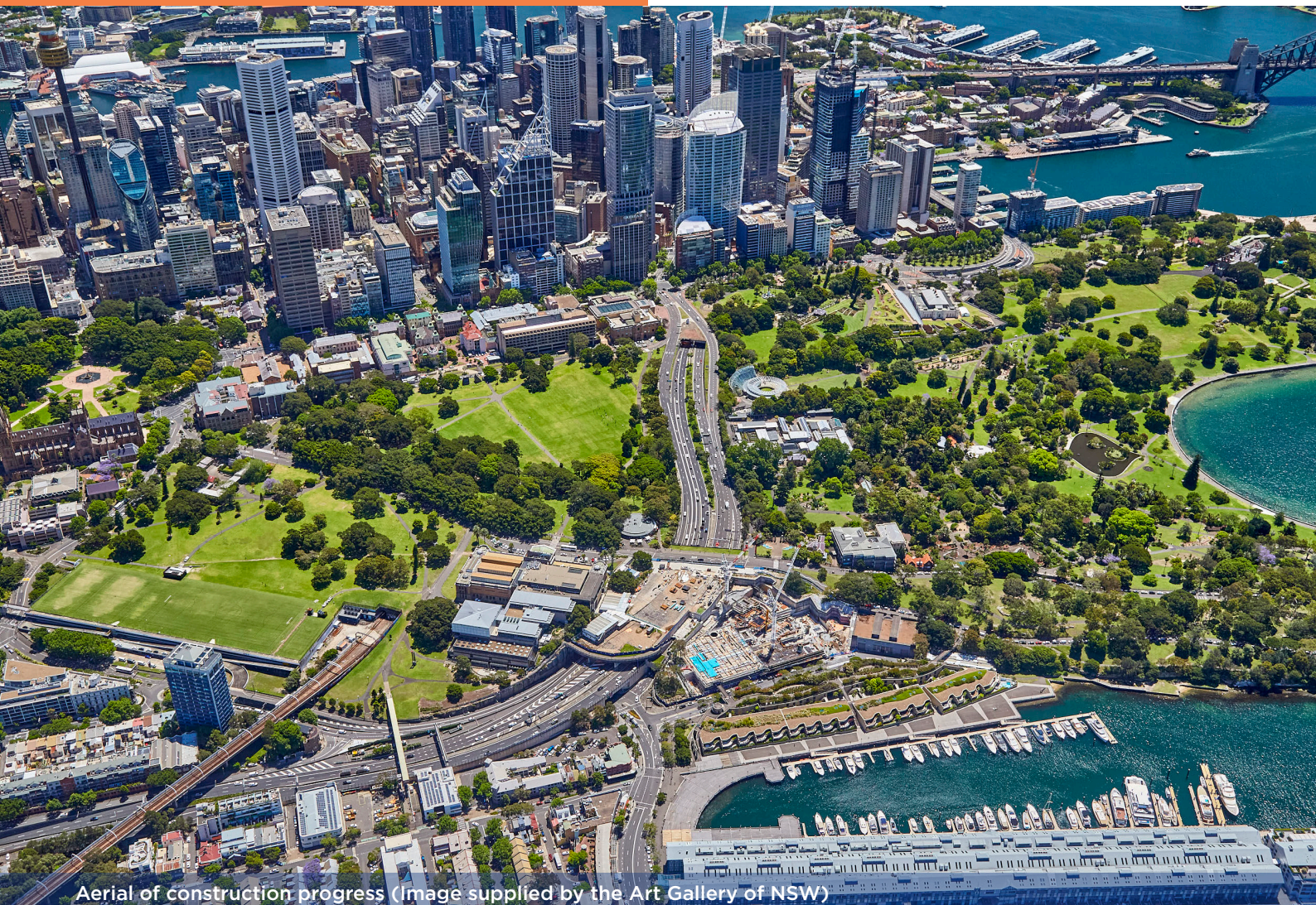
Aerial of construction progress

Stay in touch with the latest developments on the Sydney Modern Project by registering for the e-News via our project website at artgallery.nsw.gov.au/smp/faq