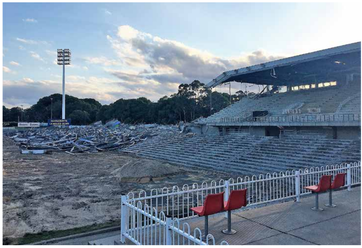
Progress photo taken of the current Pirtek Stadium demolition

This community update aims to keep you informed on project progress and ensure you are invited to have your say on the stage two planning application.