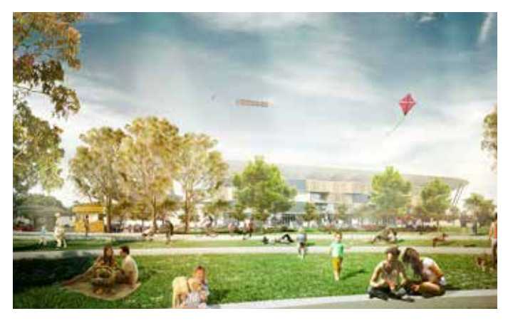
Artist Impression - The River Terraces

Inside the stadium itself, you will be able to sit within a 360-degree continuous bowl which is built at the steepest permissible angle, enclosing the field with a wall of fans and sound. The roof will provide full coverage to the seating rows and there will be a special fabric installed to enhance acoustics and visual presence to further maximise spectator experience. There will be a total of 30,000 seats closer to the action than ever seen before in Australia.