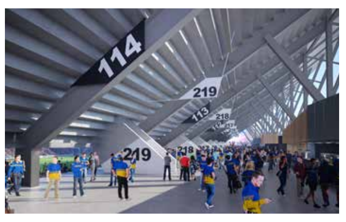
Artist Impression - An Australian stadium built from Australian steel

Additional renders are available for viewing at www.insw.com/westernsydneystadium