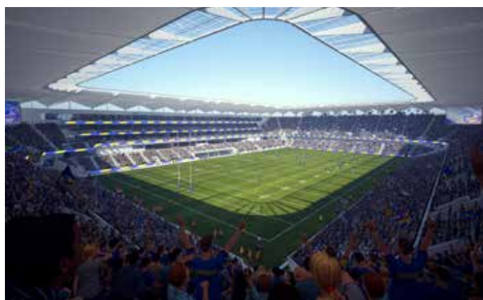
Artist Impression - The best live sport experience in Australia

The stadium has been designed with a lightweight white floating fabric roof. An iconic media mesh screen will be located above the north east stadium entry, functioning as a screen lit with team colours, logos and branding to suit specific events.