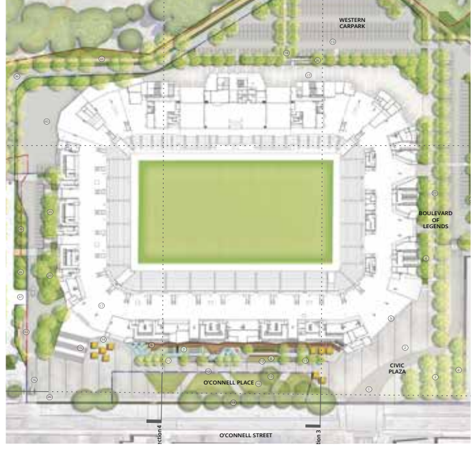
Artist Impression of the Master plan

If you have any questions about the work onsite, please do not hesitate to contact the Project Team.