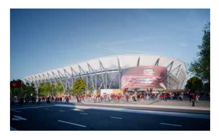
Artist Impression - A north eastern perspective of the new Western Sydney Stadium

The stadium has been designed with a lightweight white floating fabric roof. An iconic media mesh screen will be located above the north east stadium entry, functioning as a screen lit with team colours, logos and branding to suit specific events.