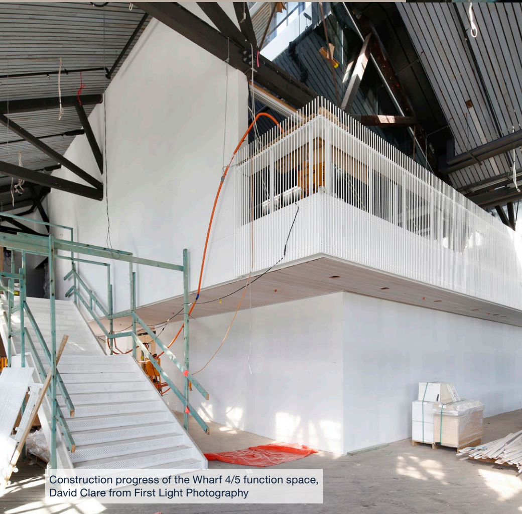
Construction progress of the Wharf 4/5 function space