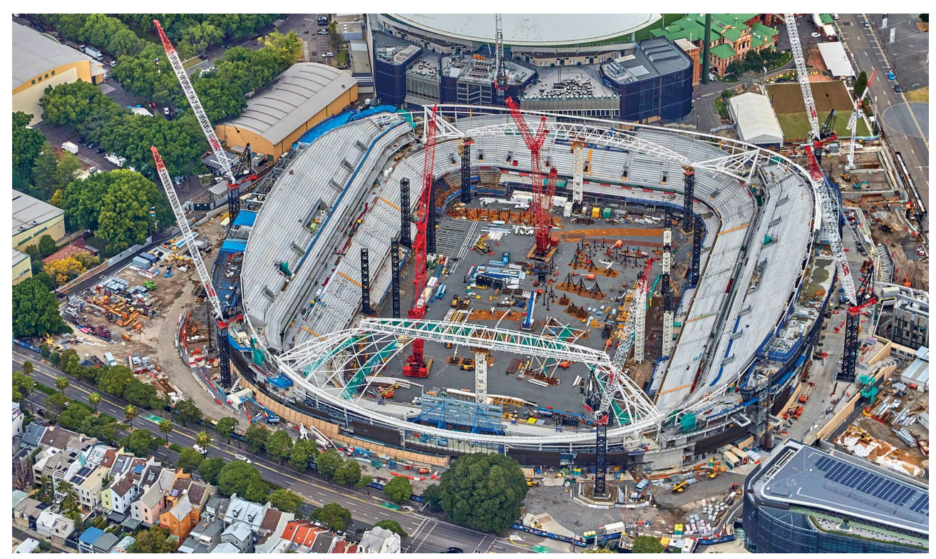
Construction progress at the Sydney Football Stadium

There are 980 curtain wall panels that surround the external façade. If placed end to end, the panels would reach over 1.7km.