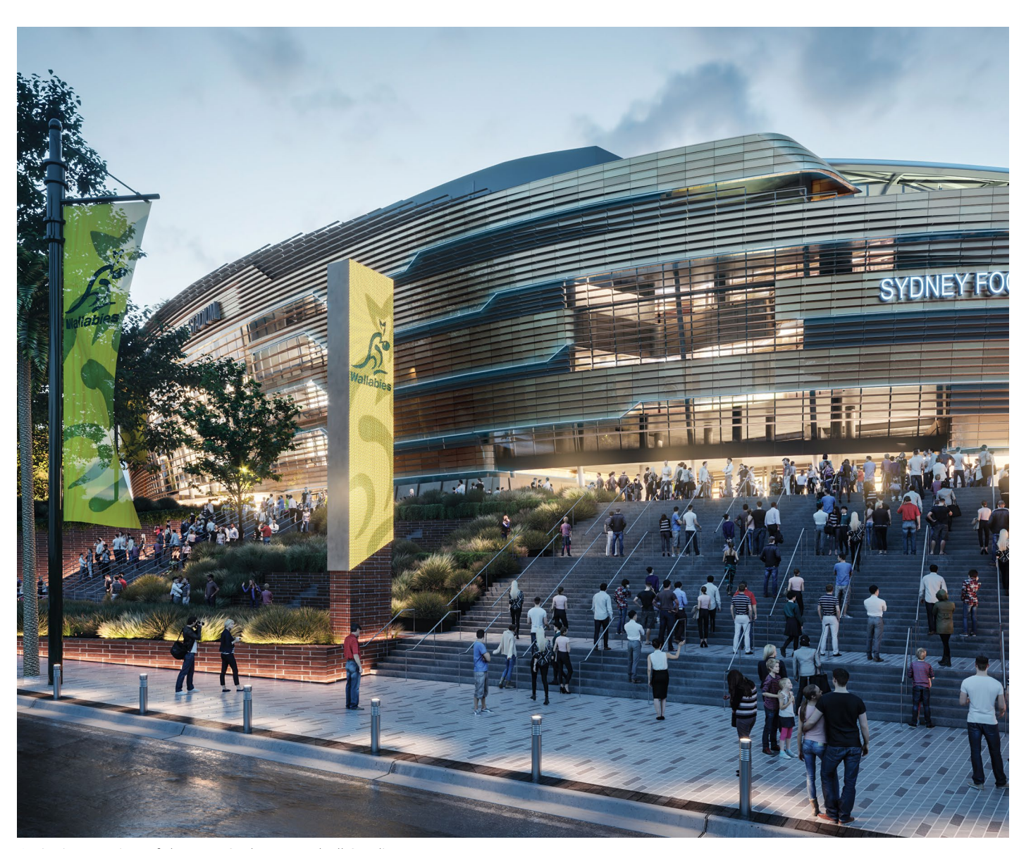
Artist impression of the new Sydney Football Stadium

The NSW Government is redeveloping the Sydney Football Stadium into a modern, world-class venue, to ensure Sydney has a sporting and entertainment precinct of an international standard and that NSW remains the number one choice for sporting and entertainment events.