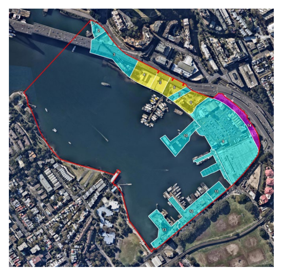
Figure 2 – Blackwattle Bay masterplanning area