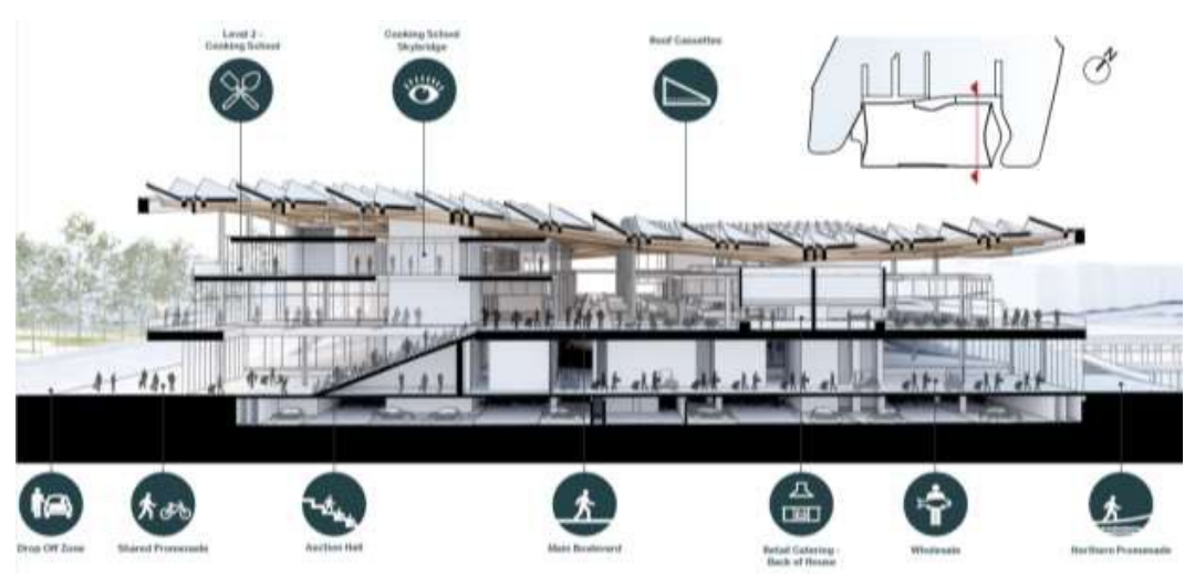
Figure 1 - New Sydney Fish Market: cross-sectional view through the auction hall

The new Sydney Fish Market will have several wharves. These will accommodate the local fishing fleet, provide a pick-up and drop-off wharf for visiting fishing vessels, space for recreational vessels as well as a public ferry wharf. The functional areas of the new facility are depicted in Figure 1.