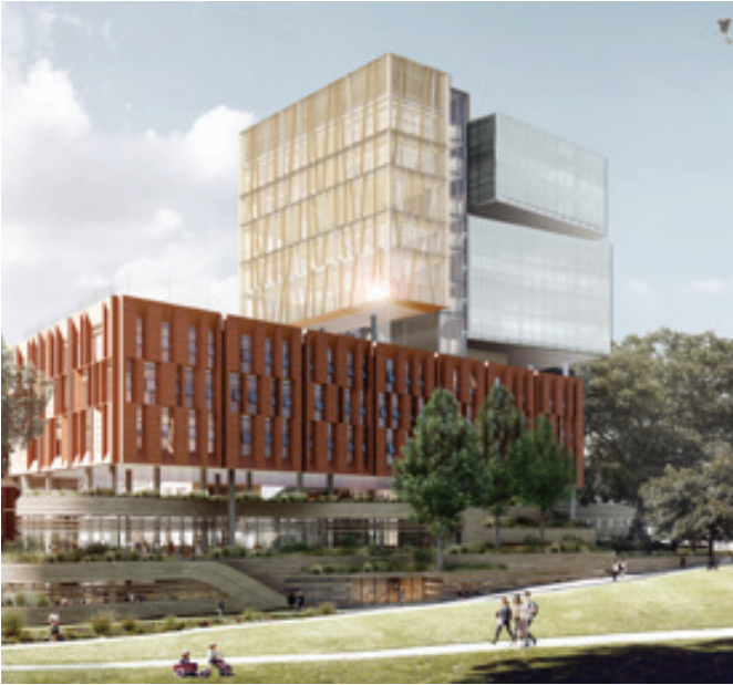
ISHS View from Prince Alfred Park