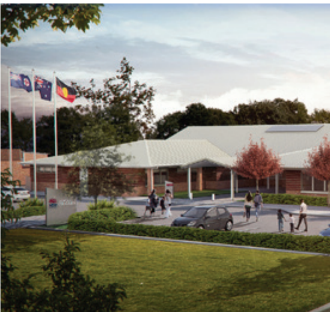
Culcairn Multipurpose Services

The upgrade to the award-winning Taronga Western Plains Zoo is part of the NSW Government-co-funded Taronga Visitor Experience program, boosting wildlife tourism offerings for NSW and offering conservation education. The upgrade is part of a 10-year program to revitalise the zoo and produce compelling animal exhibits that inspire visitors to commit to a shared future for wildlife and people.