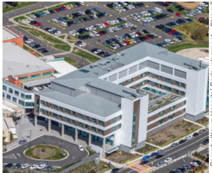
Campbelltown Hospital Redevelopment - Stage 2

The NSW Government is taking action to provide faster commutes for more Northern Beaches residents. The new B-Line double-decker bus service will provide more frequent and reliable public transport for a greater number of people travelling between the Northern Beaches and the Sydney CBD. The plan includes parking for about 900 cars at communities along the Northern Beaches, as well as pedestrian and bicycle links to bus stops as part of an integrated approach to linking people with their destinations. The B-Line service is scheduled to begin operating in late 2017.