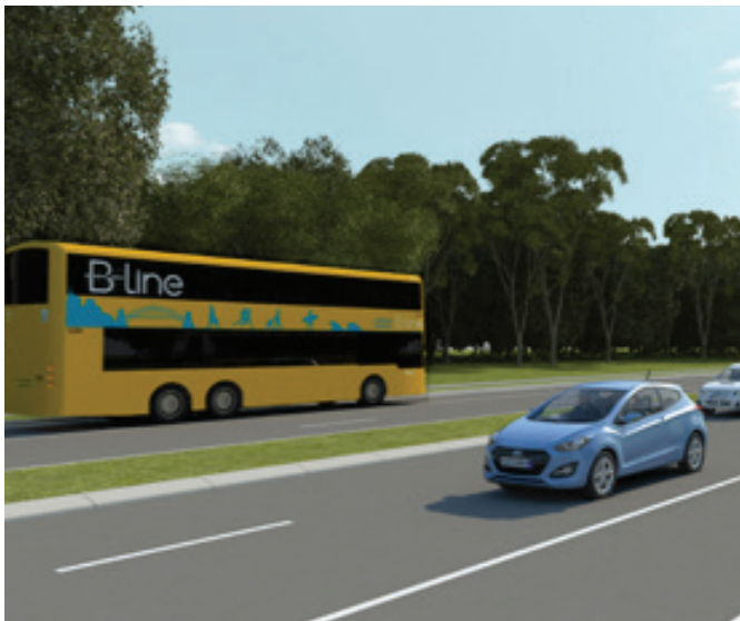
Northern Beaches B-Line bus service