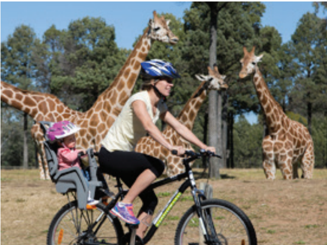
Taronga Western Plains Zoo

The new school will have 47 classrooms, as well as three science labs, music practice rooms, a food technology unit and other facilities for sport and education.